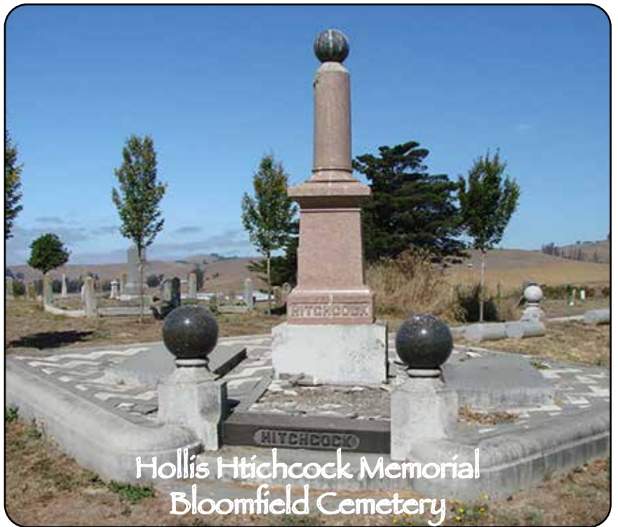
Hollis Hitchcock Memorial Bloomfield Cemetery